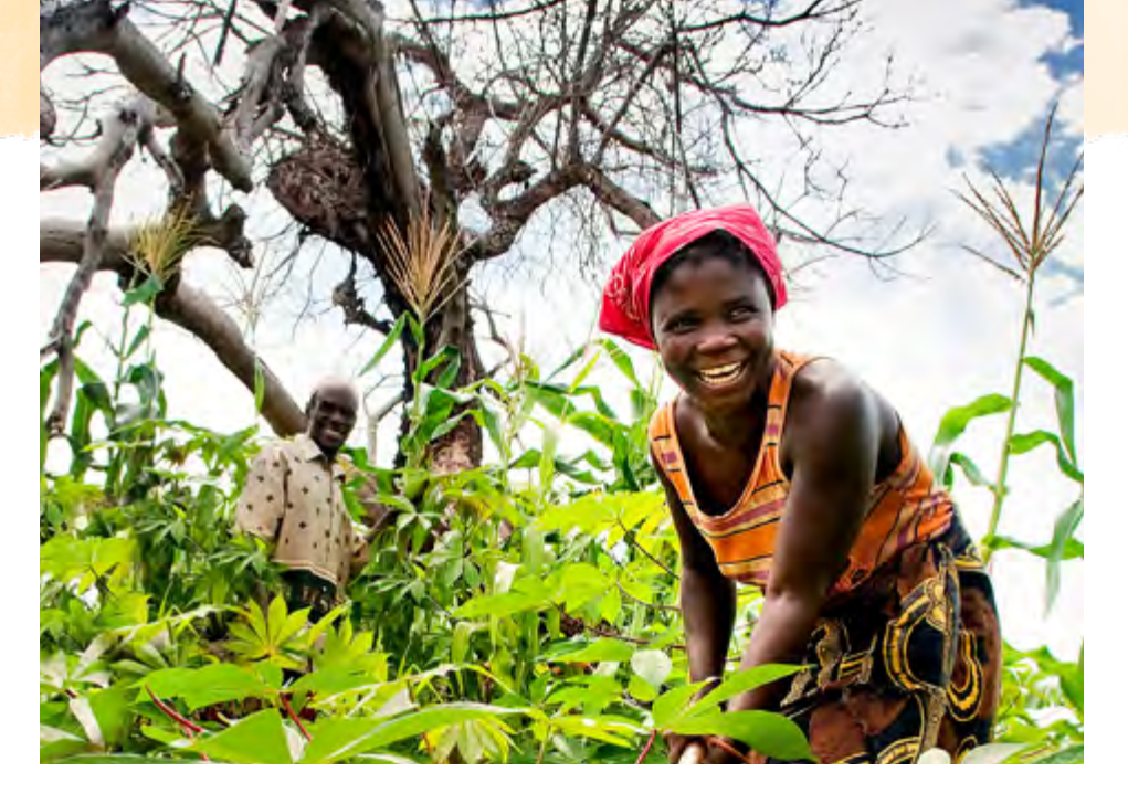
A woman tending to her crops in Topa, Mozambique.

Selzer, who joined CARE in 2008 because of its food-aid position, says progress toward enacting food-aid reform began gathering pace after CARE's decision. In 2006 the Bush administration proposed making the Food for Peace program more flexible for the first time. In 2008 the U.S. government allowed a small pilot program for local and regional procurement of food aid. In 2011 CARE helped launch a coalition of aid organizations to lobby for food-aid reform. Selzer says he saw the tide turn in 2013 when food-aid reform, which had been overwhelmingly opposed in Congress, almost got through the House.